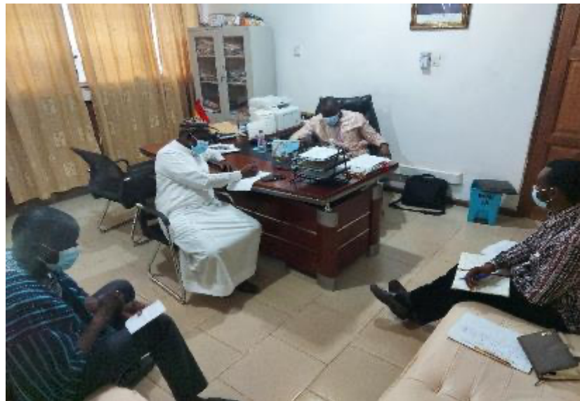
Consultation with the West Mamprusi Municipal Assembly, Walewale