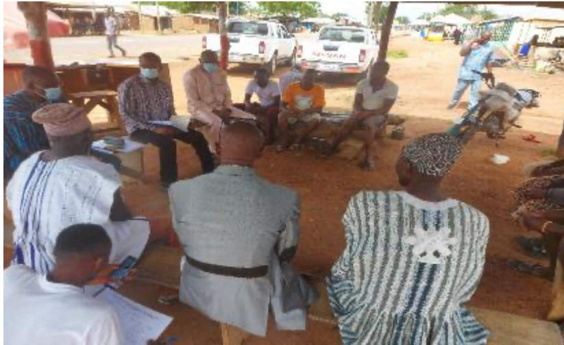
Consultation with the Unit Committee members and Opinion leaders of Tinguli, West Mamprusi District, NE Region.