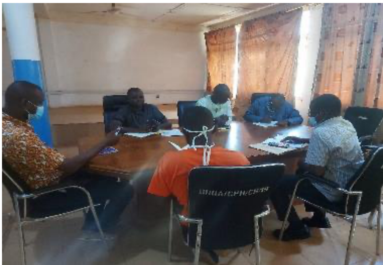
Consultation with the Builsa North Municipal Assembly, UE Region