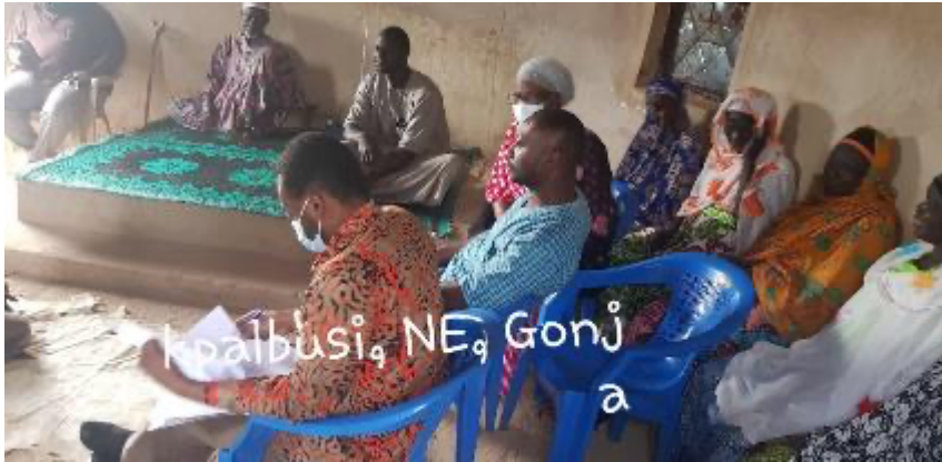
Consultation with the Chief and People of Kpalbusie, NE Gonja District, Savannah Region.