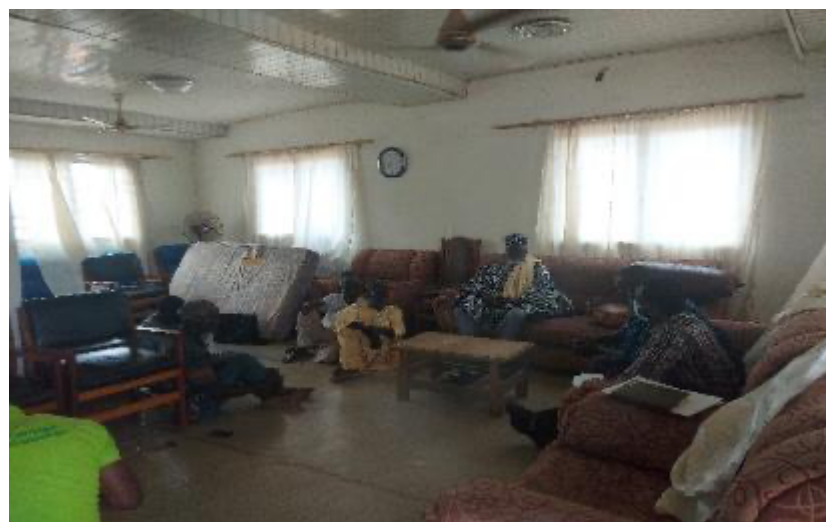
Consultation with the Chief and People of Guabulga, West Mamprusi District