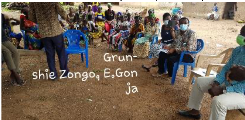
Consultation with Grunshie-Zongo Community, East Gonja District