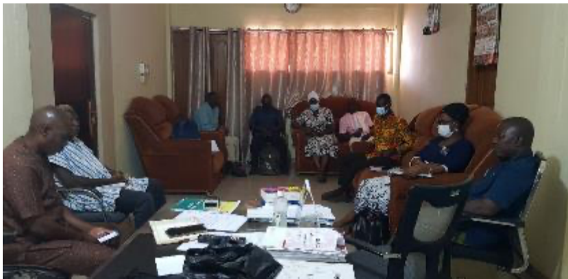
Consultation with the East Gonja Municipal Assembly