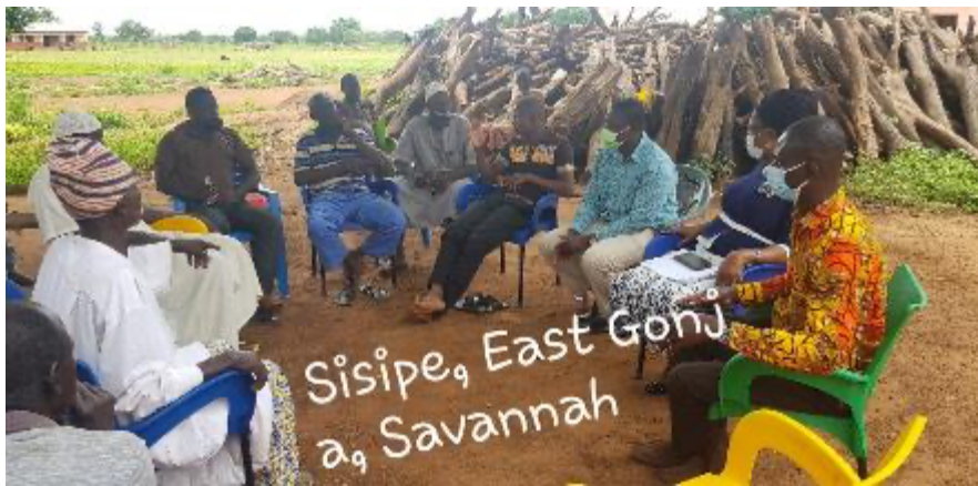
Consultation with the Chief, elders and unit committee members and Assembly man of Sisipe, East Gonja District, Savannah Region.