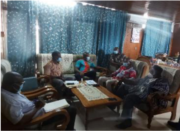
Consultation with the Upper East RCC