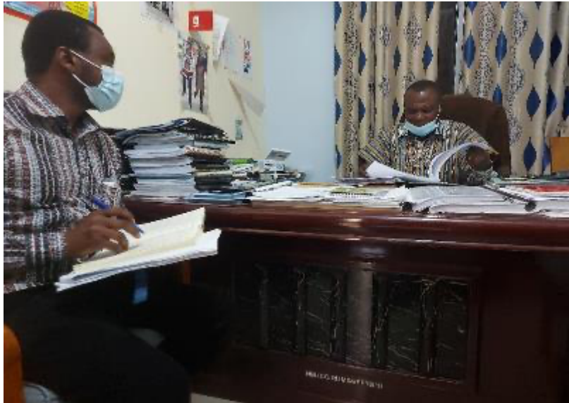
Consultation with North-East RCC