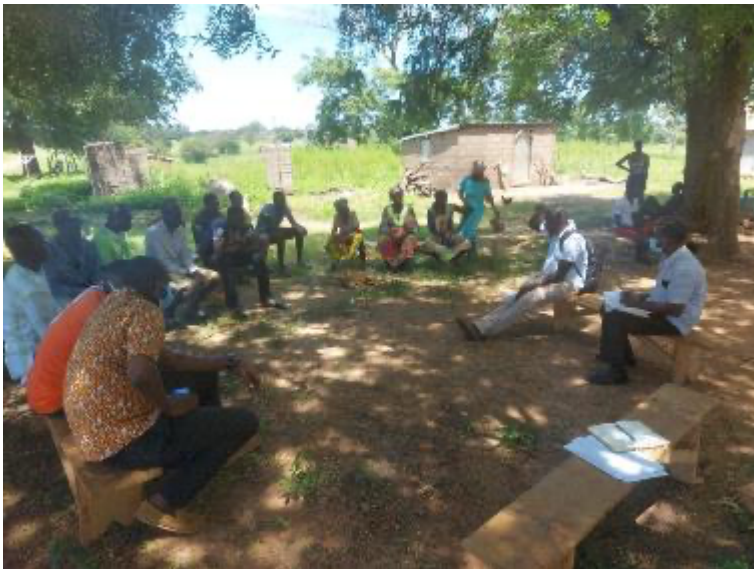
Consultation with Kalijisa Community, Builsa North District